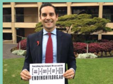
NSW Parliament supports Ending HIV