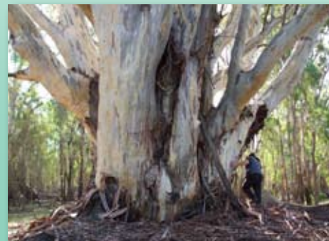
Ecological communities at risk

Revitalising Oxford Street is possible, and my recent meeting with Paddington Business Partnership members and the Small Business Commissioner confirmed that we are all working for the same outcome. Short term goals include removing the clearway, 40 kph speed limits, landscaping, branding and parking changes. Sign my petition http://alexgreenwich.com.au