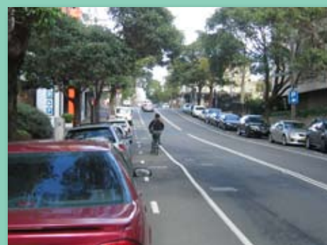
A metre really does matter to people's lives