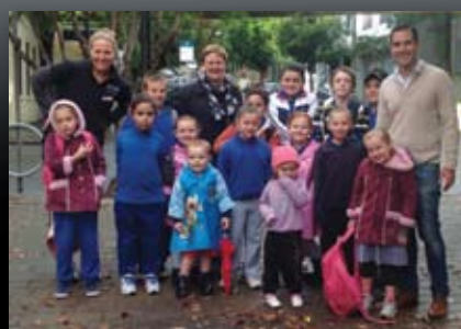
With Woolloomooloo locals on Walk to School Day