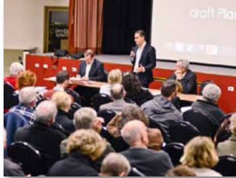
Minister hears concerns at my Planning Forum

Planning reform is needed because over a decade of ad hoc changes have stripped heritage and environment protections and people's say in shaping their neighbourhood, while handing planning decisions to unelected people.