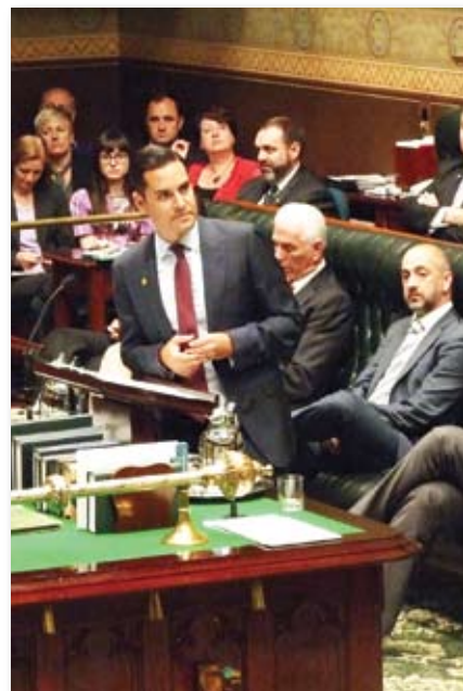
Standing up for Local Government in Parliament

I worked with other MPs to amend the bill so that councils get an opportunity to respond before being sacked and to remove provisions making them accountable to the Minister. I worked with upper House MPs to try to get the guidelines for using new powers in the regulations.