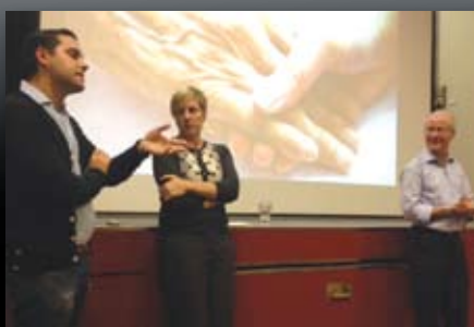
My Voluntary Euthanasia Forum in Paddington