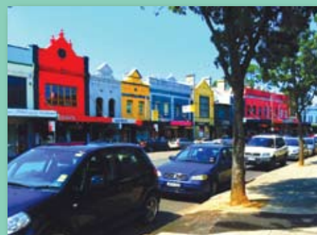
Growing Oxford Street's potential