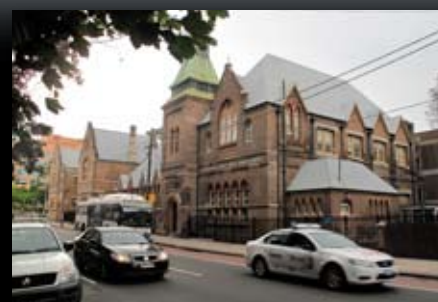
More public high school spots needed