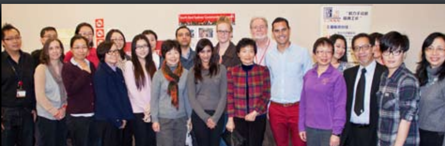
Talking health and mental health strategies with the local Chinese community

St Vincent's Hospital Mental Health Service is under pressure to discharge early and make way for others in crisis. It has a 90 per cent occupancy rate and caters for residents, visitors and workers across greater Sydney.