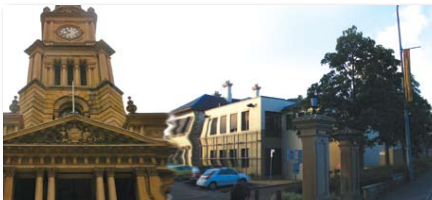
Merging councils on the agenda