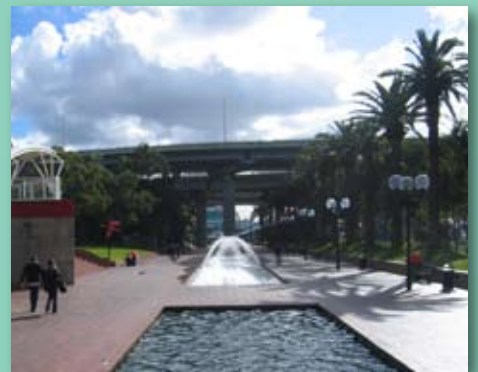
Darling Harbour to become denser?

My submission opposed the overdevelopment in the Southern Haymarket Precinct and called for consent conditions to prioritise active transport to reduce private motor vehicle reliance, traffic congestion and emissions.