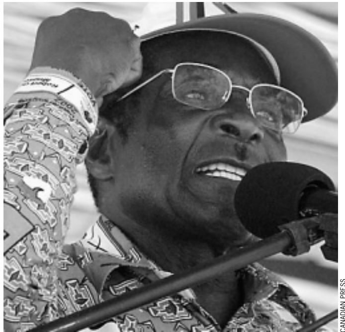
Zimbabwean President Robert Mugabe cracked down on media independence during this year's election, and then signed tough new media laws.

The Media Monitoring Project in Zimbabwe said the public press's "glaring weakness" was its failure to inform the public about the voting process. Its reports of campaign rallies catered to Mugabe's ruling party and fueled