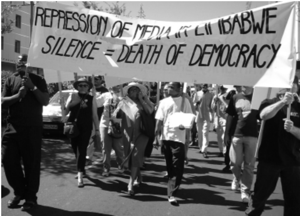
MEDIA INSTITUTE OF SOUTHERN AFRICA