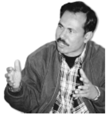
Nepali journalist Shyam Shrestha

"Not only does the general public have to live under terror fearing excesses from both the government forces and rebels, but human rights defenders and me-