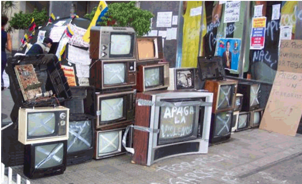
Supporters of Venezuelan President Hugo Chávez dumped television sets outside a private radio and television station in Caracas in December. Commercial media have been accused of openly backing opposition attempts to oust Chávez.