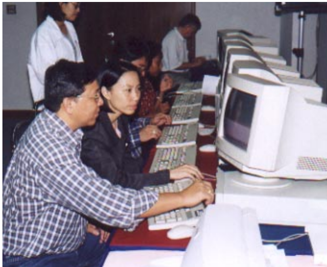
In the first phase of CJFE's training program in Thailand three years ago, a senior Thai radio journalist passes on skills to a younger counterpart.