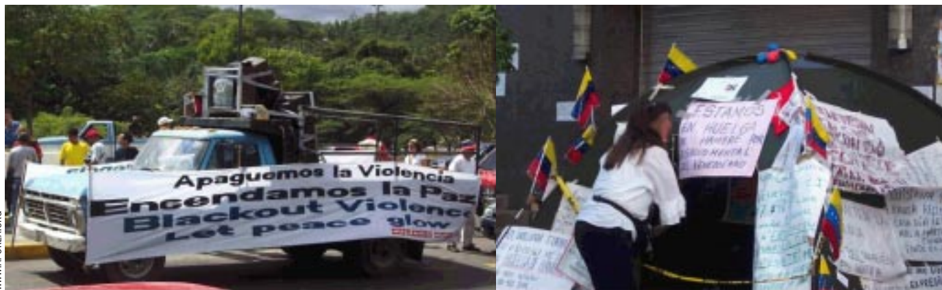
Protesters in a Caracas car caravan in December accused private TV stations of promoting violence (left). The banner urges a blackout on violence. Outside the privately owned Radio Caracas Televisión, students held a hunger strike “for Venezuelans’ mental health,” according to a placard.