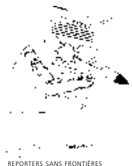
REPORTERS SANS FRONTIÈRES

HATE MEDIA: For the first time electronic media were used in support of a Nazi-type war project – the process of “ethnic cleansing.”