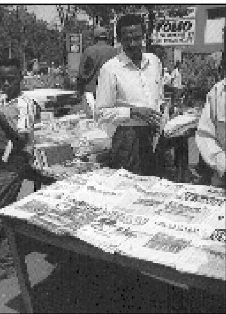
Publications on the street.

bloodthirsty and “driven by racism and hatred.” This newspaper also claimed that Tuareg rebels had endangered several “Hitlers and Mussolinis” who kill their fellow citizens merely for having black skin.