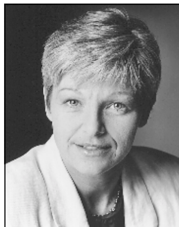
GUNNED DOWN: Irish reporter Veronica Guerin was shot dead after writing about the mafia.