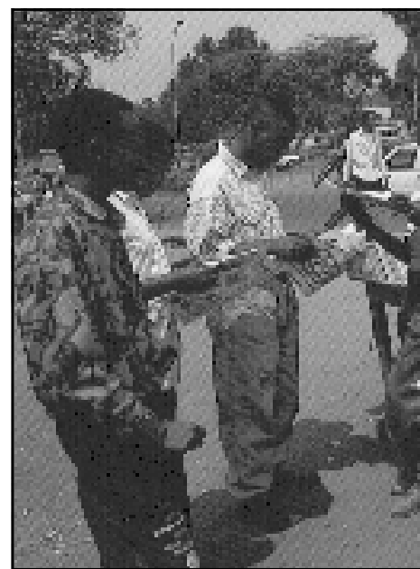
PERSUASIVE PAPERS: Rwandans peruse p

The print media are particularly persuasive, since extracting such lies from the public domain and printing them legitimizes them to readers – a legitimacy augmented by using common street parlance.