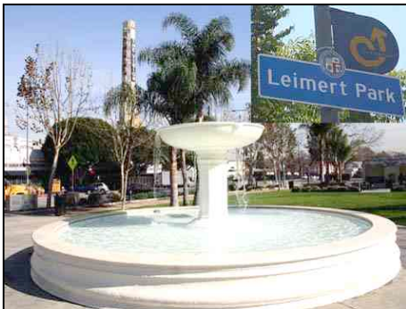
DEMAND A LEIMERT PARK STATION