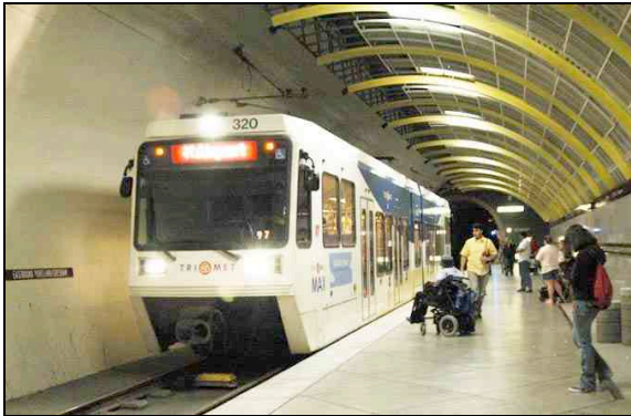
DEMAND MTA BUILD IT UNDERGROUND

Donate Today to our Legal Fund to Protect the Future of L.A.'s Last Black Business Corridor