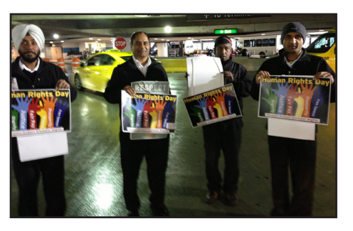
Taxis show their solidarity with airport workers on International Human Rights Day.

Many thanks to the taxicab operators who showed their solidarity with airport workers who are struggling for better working conditions during the march and protest in recognition of International Human Rights Day on December 10.