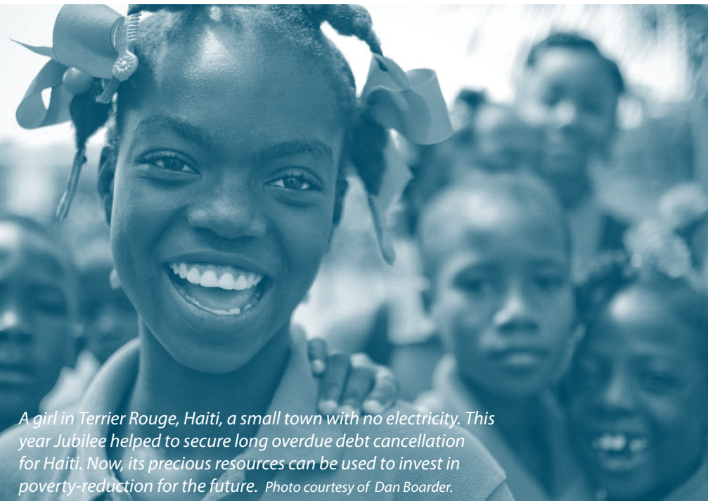
A girl in Terrier Rouge, Haiti, a small town with no electricity. This year Jubilee helped to secure long overdue debt cancellation for Haiti. Now, its precious resources can be used to invest in poverty-reduction for the future.