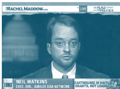
National and international press covered Jubilee's successful bipartisan advocacy for Haiti debt relief

Our relevance in Washington is possible because of our supporters on the ground. This fall we will mobilize across the country to demand that the United States take the lead to end poverty and ensure economic justice for all.