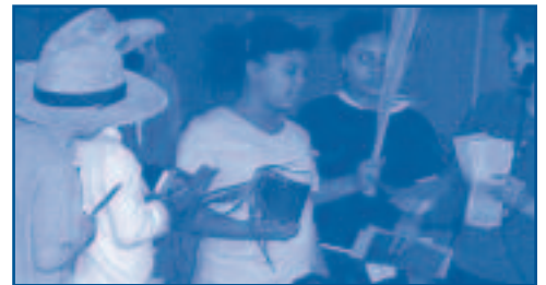
Children at Ainsworth United Church of Christ in Portland, Oregon learn about debt in their Sunday school class on Jubilee Sunday.

At St. John the Baptist Episcopal Church in Capitola, California, Jubilee Sunday was integrated with their annual Celtic service in honor of St. Patrick's Day. Several churches, including St. Andrew Lutheran Church in Whittier, California and Ainsworth United Church of Christ in Portland, Oregon, held children's versions of Jubilee