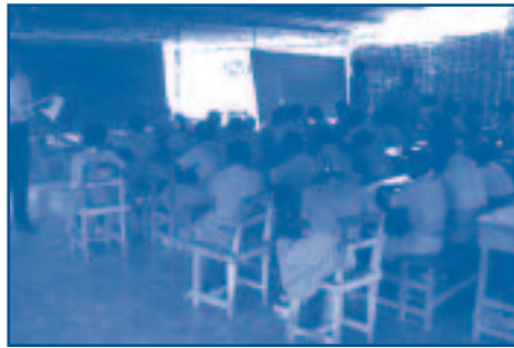
Haiti's debt forces its leaders to choose between investing in education and repairing schools or making debt service payments.

Even now that Haiti has qualified for HIPC, it will have to undertake several more years of controversial neo-liberal economic reforms that will hurt the poor to qualify for the limited cancellation promised by it. These economic policy strings will continue to drain Haiti's productive capabilities and reduce its already minimal social safety net, and they will cause deadly delays to debt cancellation at the same time. Such measures often include restricting health and education budgets; unreasonable in Haiti where severe shortages in the health and education systems exist. Haiti has already undergone years of similar harmful reforms, such as privatization of the sugar and cement industries and trade liberalization, which decimated domestic rice production. Haiti should not have to implement any more harmful economic reforms and