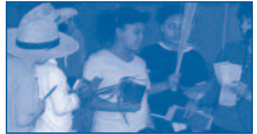
Children at Ainsworth United Church of Christ in Portland, Oregon learn about debt in their Sunday school class on Jubilee Sunday.

At St. John the Baptist Episcopal Church in Capitola, California, Jubilee Sunday was integrated with their annual Celtic service in honor of St. Patrick's Day. Several churches, including St. Andrew Lutheran Church in Whittier, California and Ainsworth United Church of Christ in Portland, Oregon, held children's versions of Jubilee