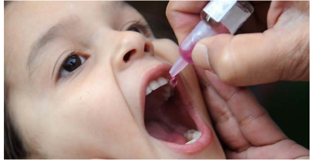
A child receives the polio vaccine. A Ukrainian company used anonymous shell companies based in Oregon to overcharge its government for vaccines, putting millions of kids at risk

Each year, hundreds of billions of dollars leaves developing countries untaxed through crime, corruption and tax evasion. The vast majority of this money leaves with the help of financial institutions based in developed countries. It's important that the United States support developing countries by making it more difficult for dirty money to flow around the world. Unfortunately, the US ranks third-to-last in the latest Financial Secrecy Index, and a recent study notes the US is the second-easiest country in the world in which to open an anonymous shell company.