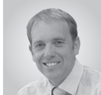
Simon Corbell MLA