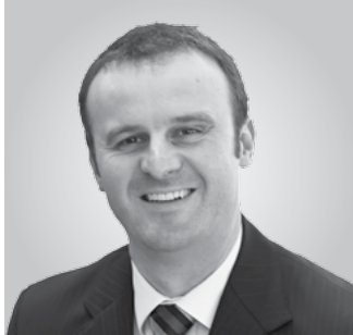
Andrew Barr MLA