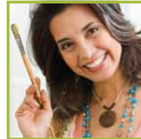
Connect to MO Art Educators!