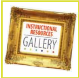
Access exclusive lesson plans!