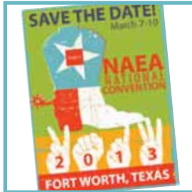
National Convention discounts!