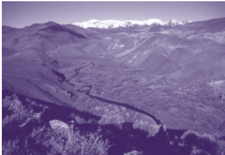
Several miles of the East Walker River flow wild and free through the Bald Mountain Proposed Wilderness.

From Reno/Carson, drive south on U.S. 395 toward Topaz Lake and Bridgeport. At Holbrook Junction (a few miles north of Topaz), turn left/east onto highway 208, and follow it over Jack Wright Summit to Wellington. From Wellington, continue south-east on highway 338 for about 16 miles. Turn left/east onto the unpaved Nye Canyon Road (Forest Rd 031) and follow it for about 7 miles (ignoring side roads that fork off) east, then south up above treeline, where Forest roads 141 and 141A will fork. Follow the left/easterly fork (141) for about 1 mile to a good parking spot before the road gets too rough. From the car, follow 141 south about 3 miles to the summit.