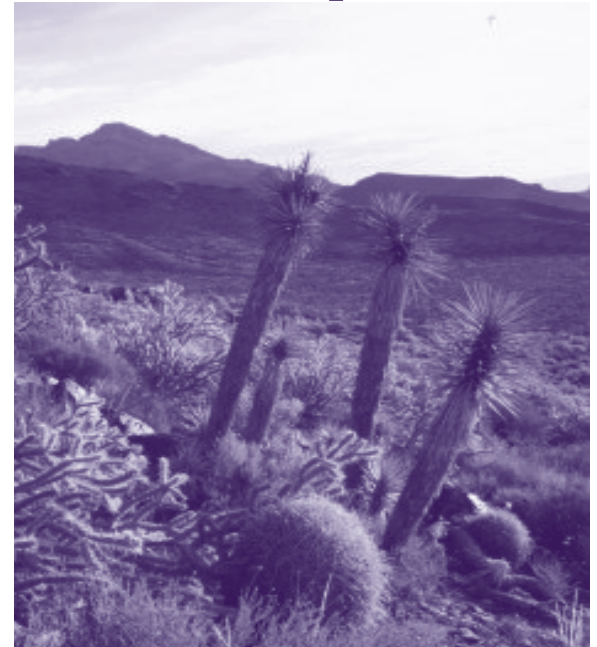
Moapa Peak, Mormon Mountains with Mojave vegetation in foreground.