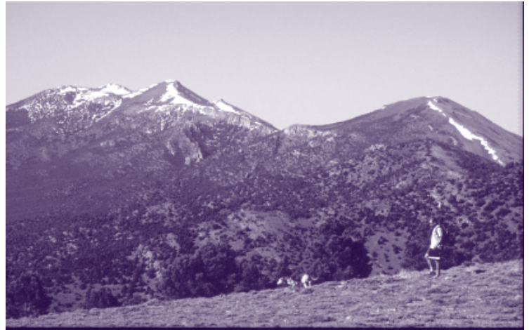
Hiker enjoying the beauty of the South Schell Creek Range proposed wilderness just outside of Ely, Nevada.

Lastly and maybe most importantly, White Pine County's wild mountains provide key watersheds for residents — human and wildlife alike. Wilderness designation will help keep these watersheds in good shape. We all count on clean water to survive.