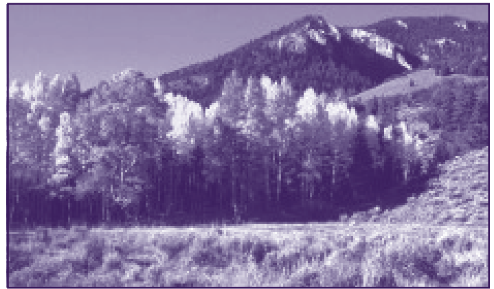
Highland Ridge, just south of Great Basin National Park, was left out of the 1989 US Forest Service wilderness bill. Friends of Nevada Wilderness is working to give its extremely high wilderness values the protection they deserve. Another world awaits beyond the far ridge.

The results of this work are invaluable — it may double the 812,000 acres of designated wilderness in the Humboldt-Toiyabe National Forest. In the northern Monitor Range, for example, an area of 40,000 acres was bisected into 3 roadless units in the USFS roadless inventory, but the dividing roads didn't exist on the ground. As a result, the Forest Service agreed that this is one contiguous area, and now we will advocate for a wilderness recommendation for the Summit and Antelopemountains.