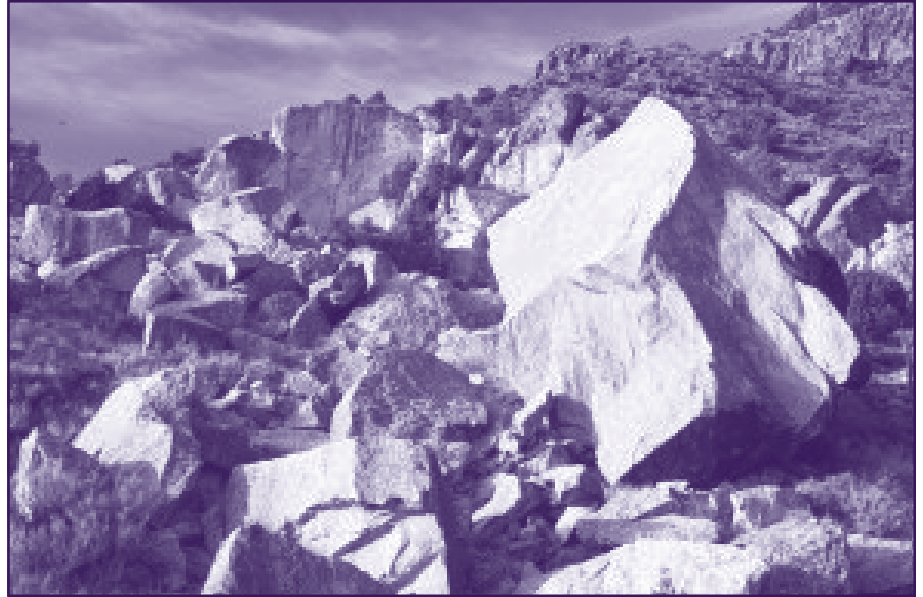
The Lincoln County bill designated two citizen-proposed wilderness areas: Big Rocks and Mt. Irish, which the BLM totally missed in their wilderness inventories. Congress, however, recognized their wilderness values, and included them.

The newly designated wilderness areas need people to be friends of Nevada wilderness. Want to get involved in the office or on the ground? Call (775) 324-7667 to learn more about becoming a wilderness advocate.