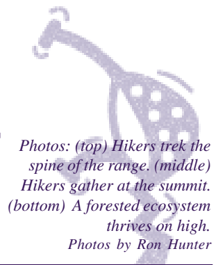
Photos: (top) Hikers trek the spine of the range. (middle) Hikers gather at the summit. (bottom) A forested ecosystem thrives on high.

This spectacular area is at the heart of the Nevada Wilderness Coalition's Wilderness Proposal for eastern Nevada. The approach to this area, in the Duck Creek Basin, has been hammered by off road vehicles in the last decade. Though the citizen-proposed area was administratively protected under the Clinton Administration Roadless Rule, the Bush Administration's relentless assault on roadless areas continues. The only way to see this area's wildland and wildlife values permanently protected is to designate the area as Wilderness. With the eastern Nevada public lands process underway, now is the time to visit, write letters, and call elected officials to tell them this area needs the protection afforded by Wilderness designation.