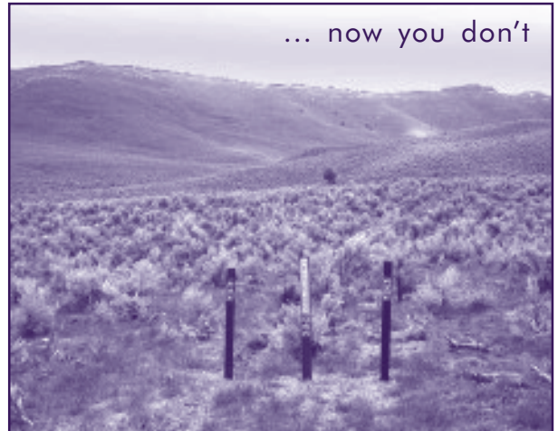
Work trip in the South Jackson Wilderness decommissions a vehicle trespass route.