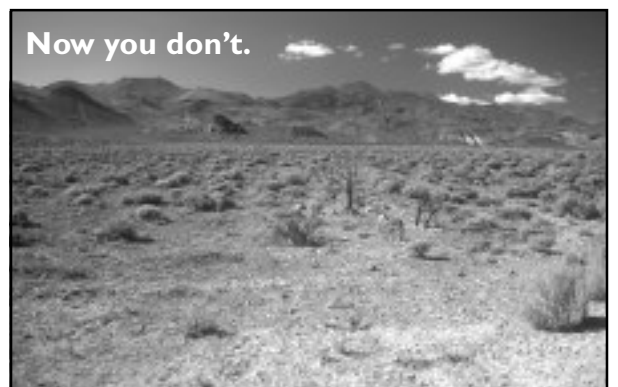
Before and after photos of two routes restored to natural landscape by the NCC crew.