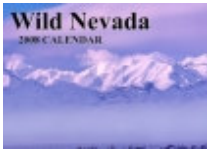
Wild Nevada Calendar $12.00*

*For quantities of 5 or more please call our office for special pricing.