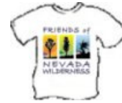
Organic Cotton T-Shirt. Logo on back. Assorted Colors. $10.00