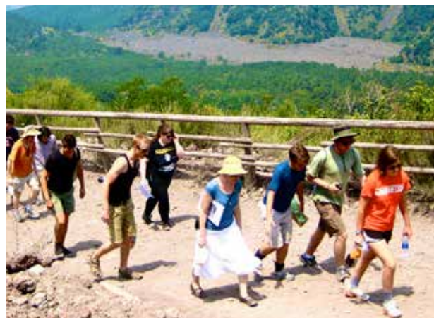
Paideia students trek up Mt. Vesuvius to read Pliny's letter at the top.