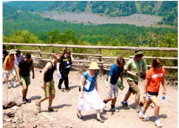
Paideia students trek up Mt. Vesuvius to read Pliny's letter at the top.

AM - Transfer to Fiumicino Airport PM - Flight to USA