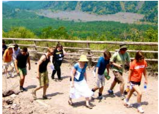
Paideia students trek up Mt. Vesuvius to read Pliny's letter at the top.