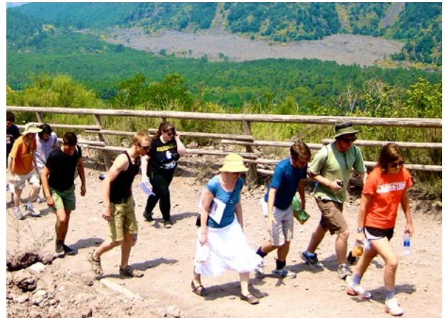
Paideia students trek up Mt. Vesuvius to read Pliny's letter at the top.