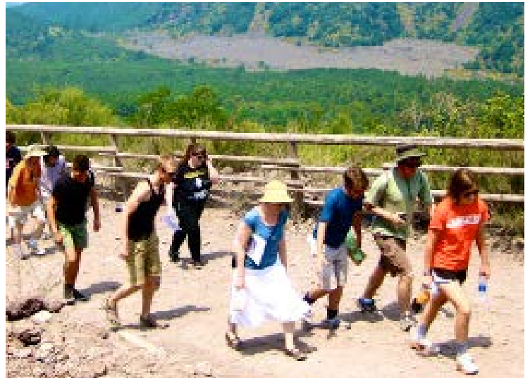
Paideia students trek up Mt. Vesuvius to read Pliny's letter at the top.

Saturday, April 2 (Departure Day) AM - Transfer to Fiumicino Airport PM - Flight to USA