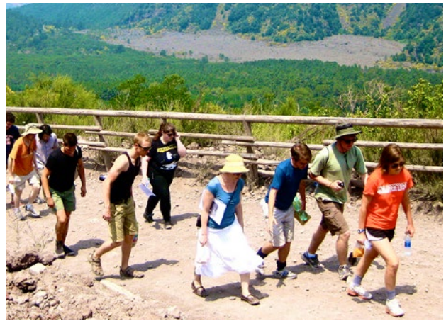
Paideia students trek up Mt. Vesuvius to read Pliny's letter at the top.