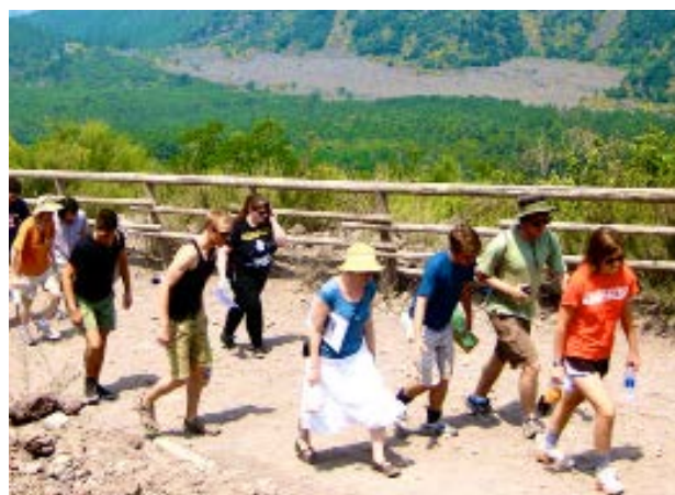
Paideia students trek up Mt. Vesuvius to read Pliny's letter at the top.