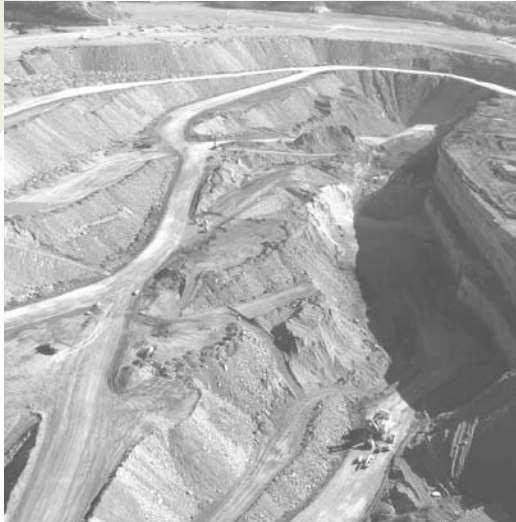
Wells Fargo-funded mountaintop removal is a common sight throughout Appalachia.