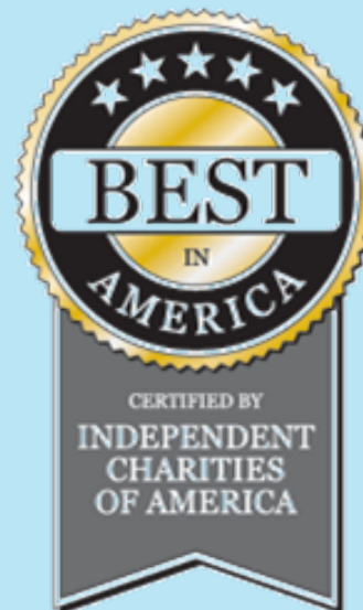
SNAP AWARDED “SEAL OF EXCELLENCE”

The Independent Charities Seal of Excellence is awarded to the members of Independent Charities of America and Local Independent Charities of America that have, upon rigorous independent review, been able to certify, document, and demonstrate on an annual basis that they meet the highest standards of public accountability, program effectiveness, and cost effectiveness. These standards include those required by the US Government for inclusion in the Combined Federal Campaign, probably the most exclusive fund drive in the world. Of the 1,000,000 charities operating in the United States today, it is estimated that fewer than 50,000, or 5 percent, meet or exceed these standards, and, of those, fewer than 2,000 have been awarded this Seal.