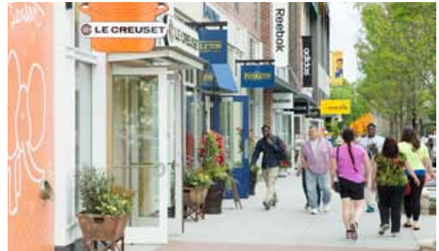
Somerville's Assembly Square area is being revitalized, thanks in part to strategic transportation investments.

Improving public health and reducing greenhouse gas emissions —A healthy Massachusetts is a productive Massachusetts, and transportation has a big influence on our health. People who walk, bike or take transit for transportation have lower rates of obesity and lower health care costs 3 than those fully dependent on automobiles. Smart transportation investments can expand residents' access to transit and active transportation, while contributing to Massachusetts' efforts to cut greenhouse gas emissions.