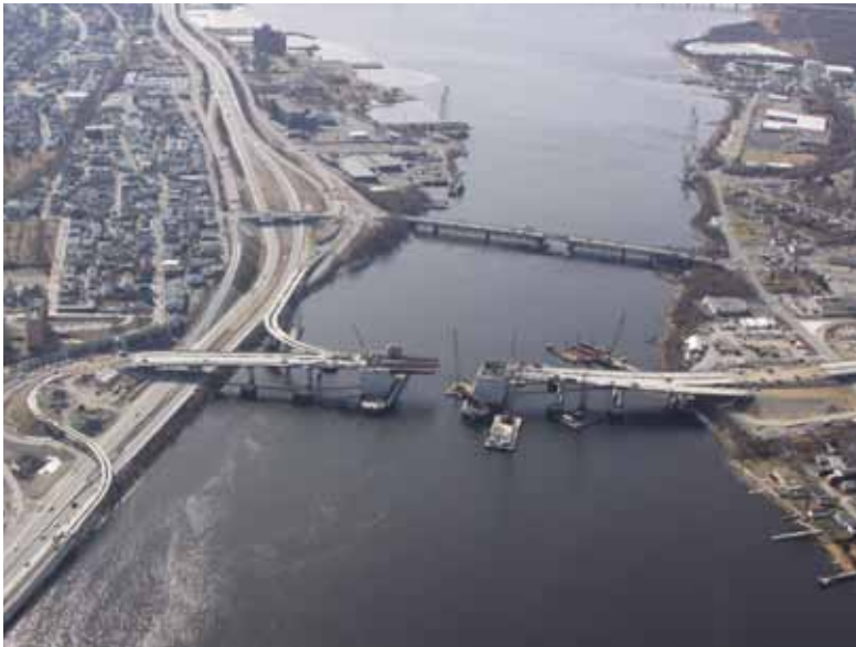
Massachusetts' transportation system is beginning to emerge from years of debt and decay. Here, a new bridge is completed to replace an 1906 span over the Taunton River.

Transportation policy in Massachusetts is at a pivotal moment. In recent years, the Commonwealth has finally taken the first steps toward reversing the transportation system's long slide into debt and decay. Long-awaited reforms to transportation agencies are underway. Long-deferred projects to repair and modernize our transportation system are finally moving forward.