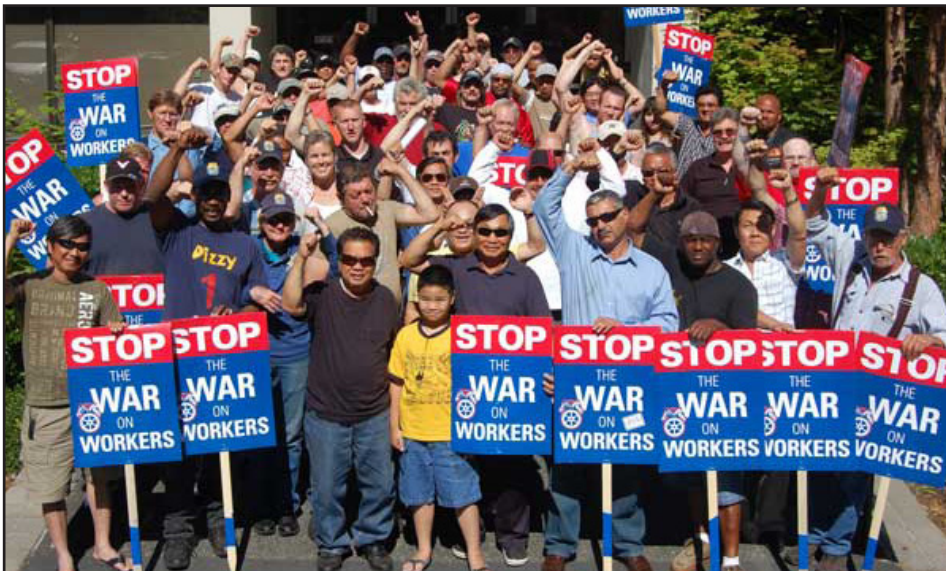
Workers at Davis Wire went out on an Unfair Labor Practice strike on May 21.

Contract fights at Davis Wire, Waste Management, Sysco, UNFI, FSA and DOC