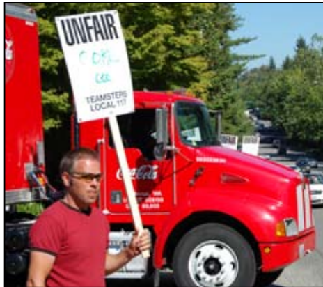
Teamsters at Coke take a stand! Union members, family members, and community supporters raise pickets against Coke for multiple unfair labor practices.