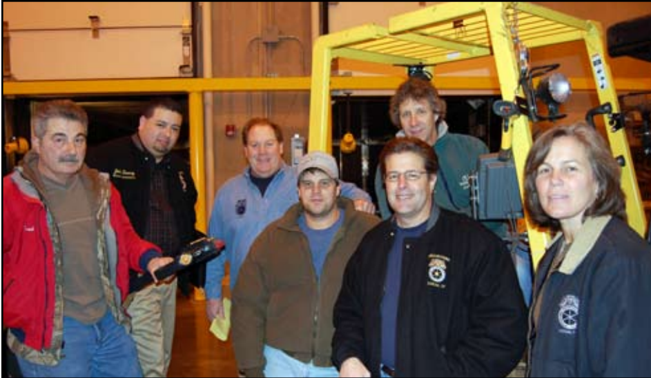
Teamsters Local 117 members at Safeway celebrate 2008 lumber arbitration victory.

Safeway Teamsters work in a new, state-of-the-art facility on 116-acres in Auburn. The new location boasts a 538,000-square-foot dry goods warehouse and a 515,000-sq-ft refrigerated warehouse. Together with a recycling center, trucking department, dispatch office, fuel station, truck repair shop, and administration center, the site is imposing. A massive, 2 1/2-year construction project preceded its opening in 2005.