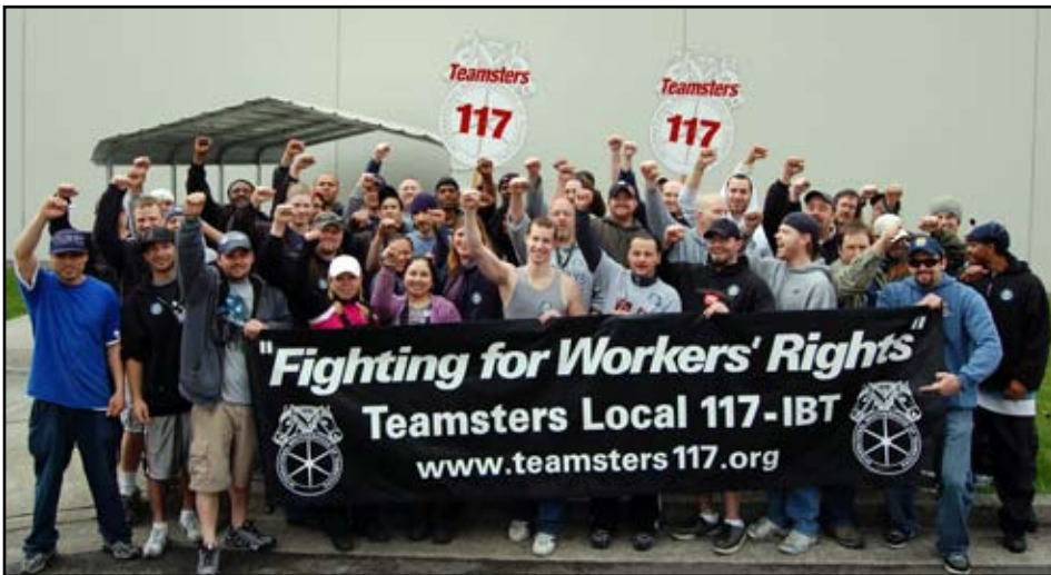
Fred Meyer Teamsters gather in support of the janitors organizing campaign.

Y ou know you are in a strong Union shop when members can sit down face to face with management and openly voice their concerns in an effort to resolve issues at work. That is exactly what happens on a monthly basis at the Fred Meyer grocery warehouse distribution center in Puyallup.