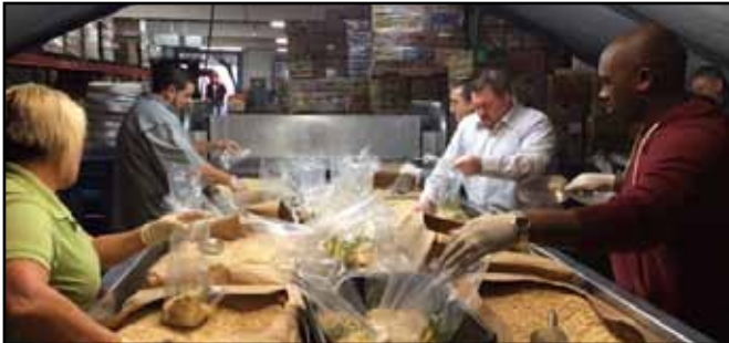
Teamster volunteers repack donated grain for Pierce County families.

Stepping up to help feed hungry families in our community