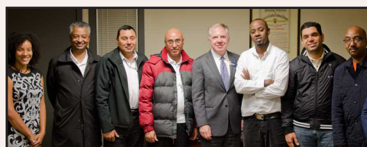
WWTCOA Leadership Council members meet with mayoral candidate Ed Murray.