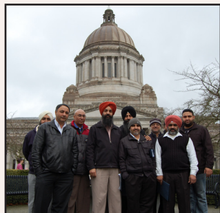
Taxi drivers lobbying in Olympia during the 2013 legislative session