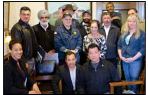
Local 117 Lobby Day 2013

T he 2014 legislative session is right around the corner, and we are busy establishing our legislative priorities so that we can hit the ground running.