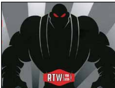
Don’t be fooled by “Right to Work”

I n the wake of the decision by workers at Boeing to hold the line on protecting good-paying jobs and strong pensions, one state legislator from Spokane has introduced legislation called “Right to Work.” What exactly is “Right to Work” and how would it impact us?