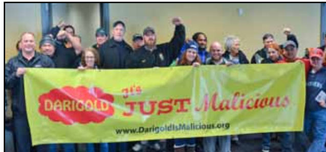
Darigold workers gather before a leafleting action on Nov. 24.

Lab techs and production workers win new contract after 8-month fight