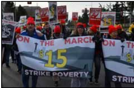
Workers march for a $15/hr minimum wage in Seattle.

Building on the momentum from the Prop 1 victory in SeaTac