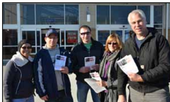
Darigold members leaflet outside of the Renton Walmart.