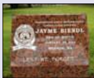
WSR Walk of Remembrance

The representational work described in the Facility News section is not comprehensive. Any feedback or suggestions you have is appreciated!