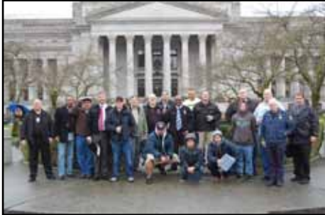
Teamsters Lobby Day - 2013

Lobby Days Scheduled for Jan. 28 & Feb. 20