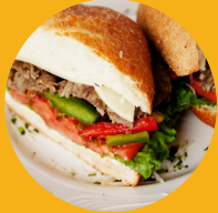
somali beef sandwich