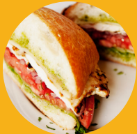
grilled chicken breast sandwich