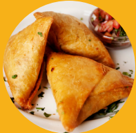
sambusa / beef or veggie