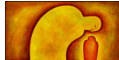
Illustration copyright © 2002 Roxana Villa

Through the Neighbors in Need Offering, JWM provides much-needed financial support for projects that combat hunger, poverty and injustice. JWM also offers organizing muscle on public policy issues affecting economically disadvantaged persons, including federal budget priorities, health care access, welfare spending, living wage campaigns and equitable funding for public schools.