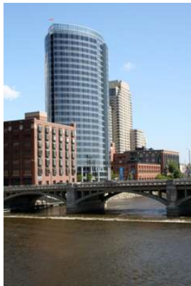
Grand Rapids, Michigan

With the help of local health care providers, the Health and Wholeness Advocacy office and UCAN, Inc. will host a health fair at Synod, which will include free information and tests, such as cholesterol, HIV, blood pressure, etc. Door prizes included! Come find out more about the status of your own personal health!