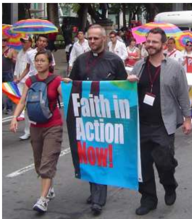
People of Faith March to end discrimination and homophobia at the International AIDS Conference. Mexico City, Mexico, August 2, 2008