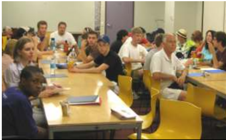
HIV seminar participants

R iverside Church Global HIV and AIDS Ministry, AIDS Service Center New York City, the United Church of Christ HIV and AIDS Network and Conscious Contact of New York had the opportunity to collaborate with The Presbyterian United Nations Office by hosting the New Providence Presbyterian Church of Maryville, Tennessee in a week-long seminar mission program from 7-10 July 2008. The program, entitled, "Living the Goals" is a combination classroom and interactive ministry educational experience intended to introduce youth to questions of urban poverty through the lens of the Millennium Development Goals (MDGs).