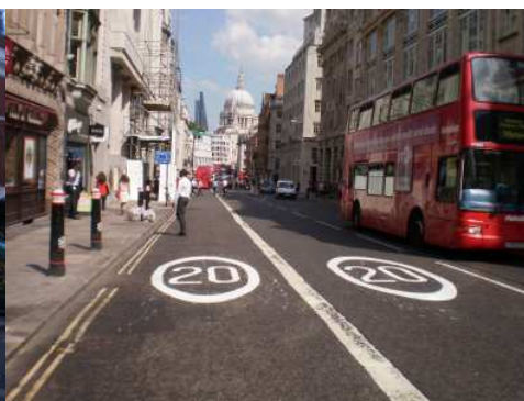
20mph Limits in the City of London