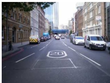
Southwark Street (June 2016)