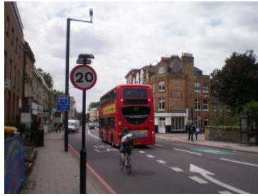
Camberwell Town Centre