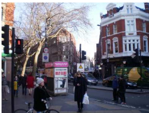
20mph Limits in Camden