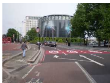
IMAX Roundabout Waterloo