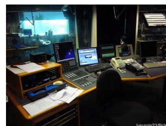
Radio Studio, ABC Centre, Ultimo, Sydney