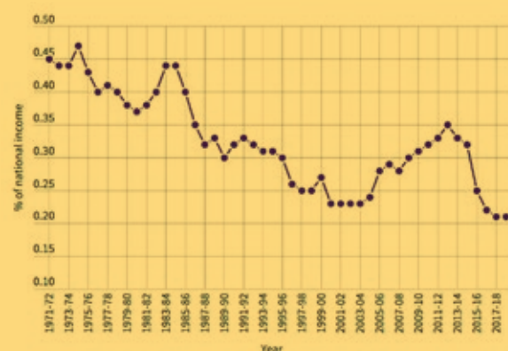
Percentage of Australia's national income spent on foreign aid