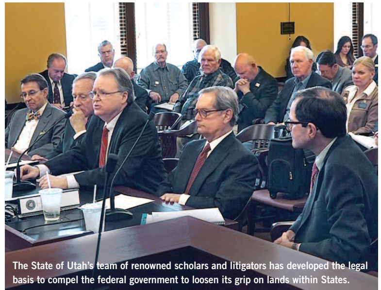
The State of Utah's team of renowned scholars and litigators has developed the legal basis to compel the federal government to loosen its grip on lands within States.