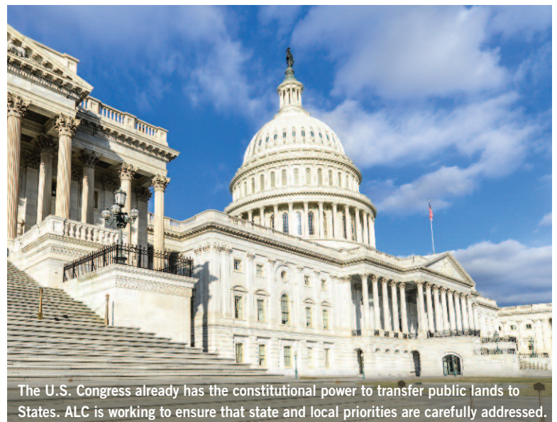
The U.S. Congress already has the constitutional power to transfer public lands to States. ALC is working to ensure that state and local priorities are carefully addressed.