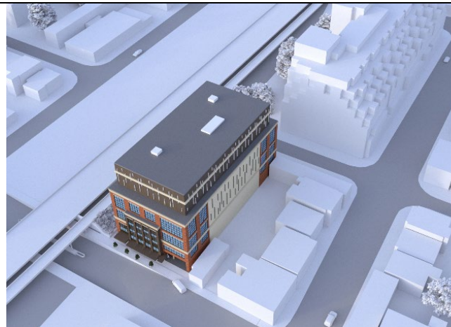
Architect's rendering looking north-east