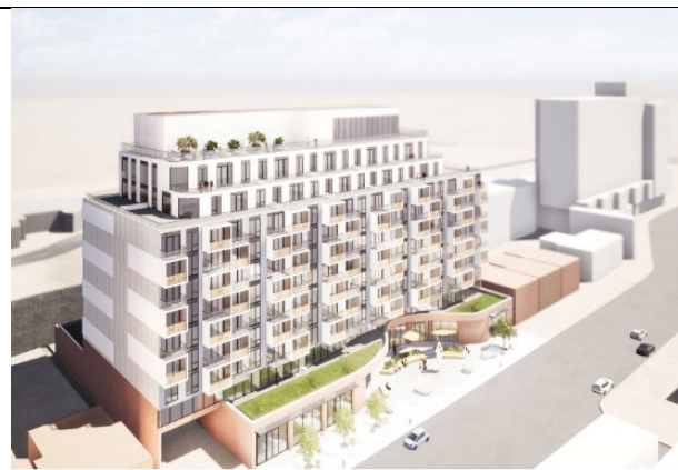
Architects' rendering (looking north west)