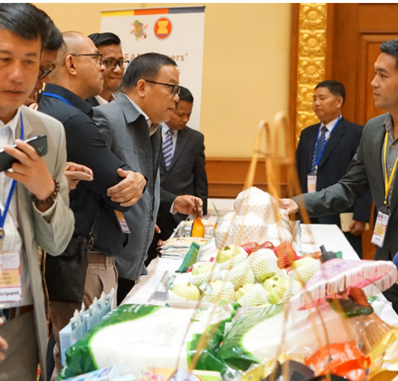
Photo of the 8th ASEAN Cooperative Business Forum, 26 February 2019