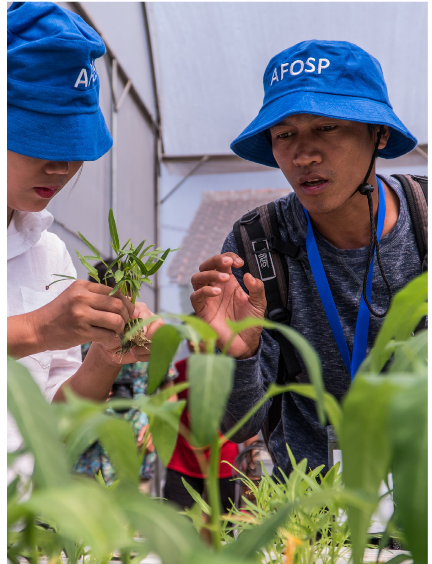
▲ ASEAN-EU Youth Forum 2017