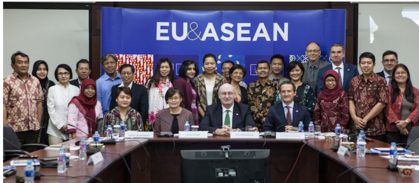
▲ Roundtable Discussion on Strengthening Farmers' Organisations/ Agricultural Cooperatives and Attracting Youth in Agriculture, Jakarta, 7 November 2016 at the ASEAN Foundation