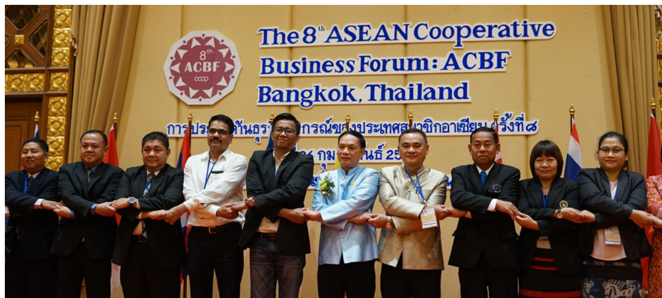
▲ 8th ASEAN Cooperative Business Forum, 26 February 2019 in Bangkok, Thailand