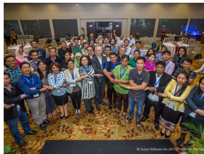
▲ ASEAN Learning Series and Policy Engagement on Agricultural Cooperatives (ALSPEAC), Yogyakarta, 19-21 July 2017