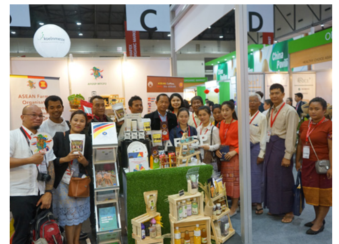
▲ ASEAN Learning Series 2018 (attend the food expo "THAIFEX") in Thailand