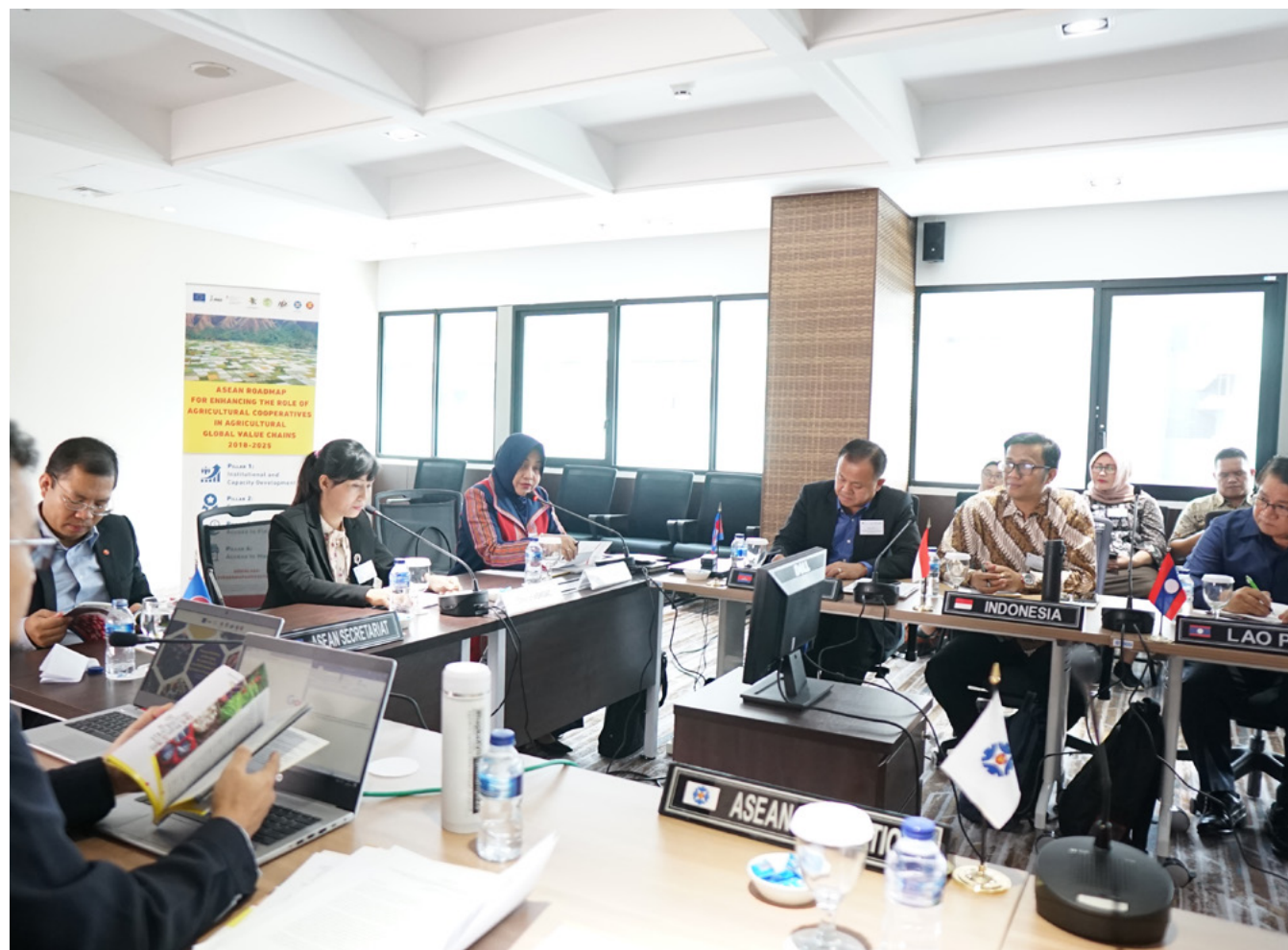
▲ Photo of 2nd Regional Workshop