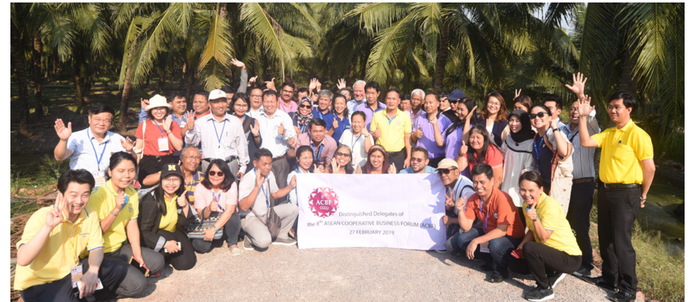
▲ 8th ASEAN Cooperative Business Forum (Field Visit), 27 February 2019 in Bangkok, Thailand