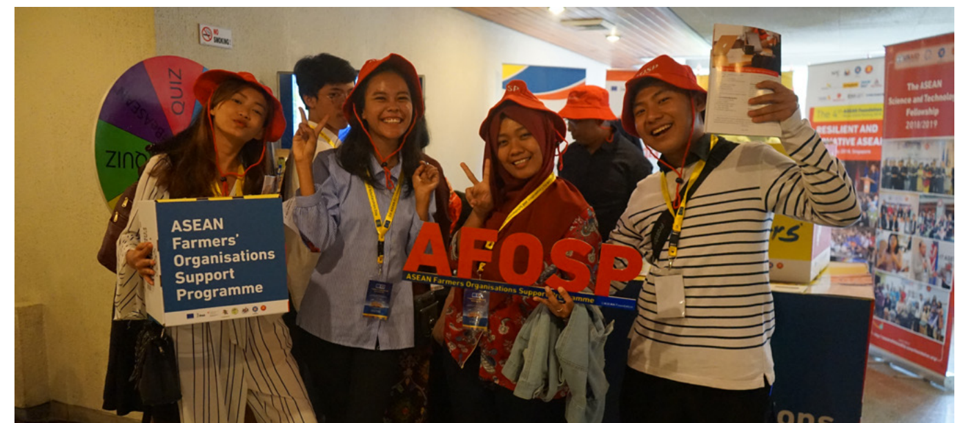
▲ ASEAN-EU Scholarship and Cooperation Day 2018 in ASEAN Secretariat