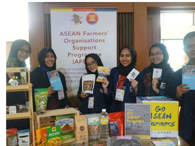
▲ ASEAN Goes to UIN (State Islamic University Syarif Hidayatullah Jakarta) 2019