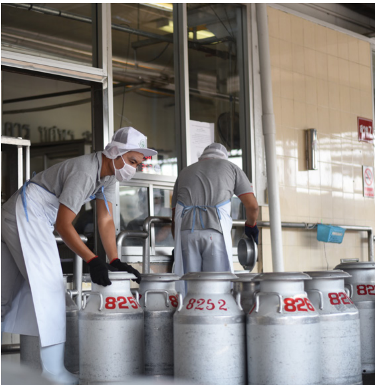
Photo of Field Visit to Nongpho Cooperative In