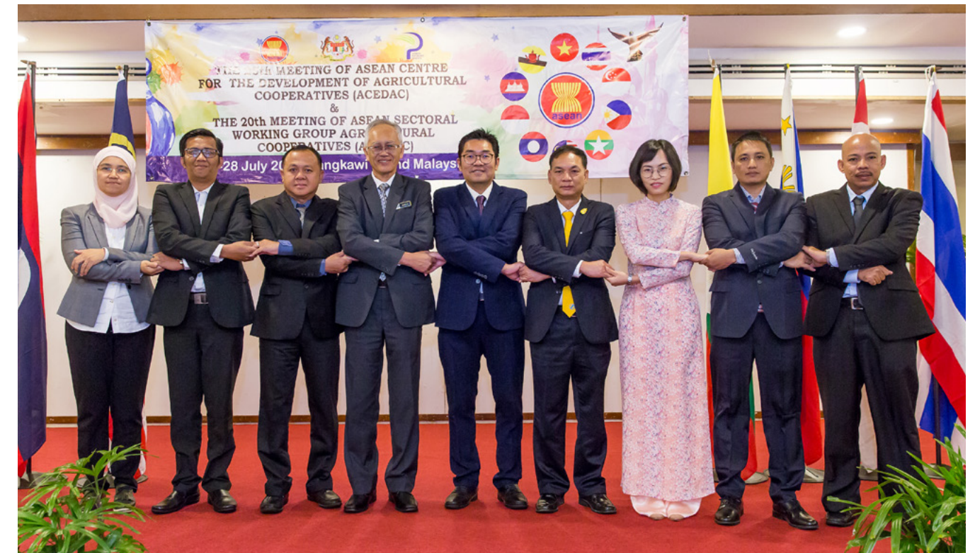
▲ Photo of the 20th Meeting of ASEAN Sectoral Working Group Agricultural Cooperative

"ASEAN Farmers' Organizations Support Program (AFOSP) plays a significant role in the development of the ASEAN (Roadmap for Enhancing the Role of Agriculture) Cooperative in the Global Value Chain (2018-2025). Coming upwith a blueprint, we can accelerate and ensure the development of the