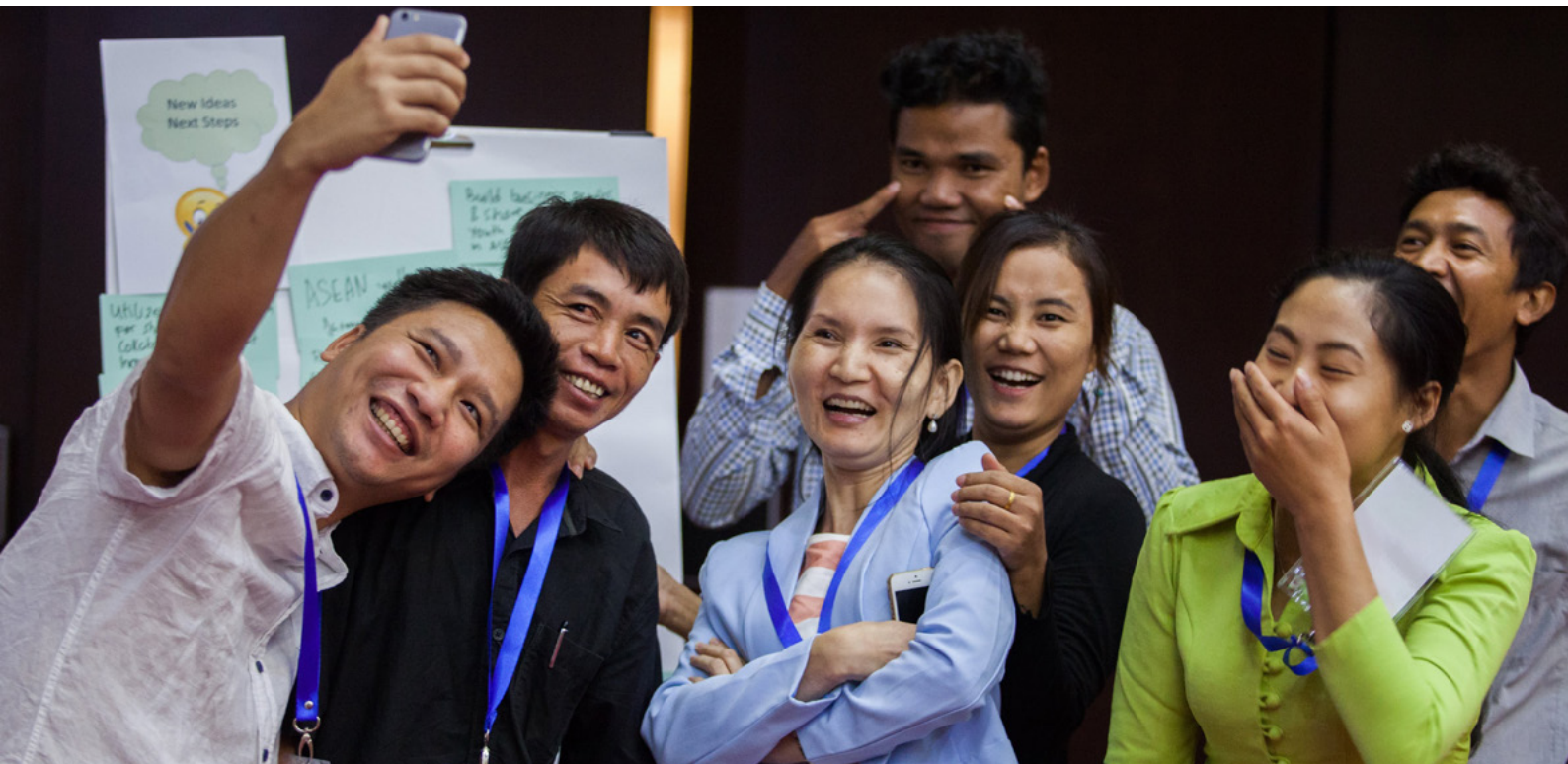
Photo of ASEAN EU Youth Forum.