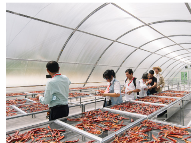
▲ ASEAN Learning Series 2018 (Field Visit to Solar Dryer Dom) in Thailand