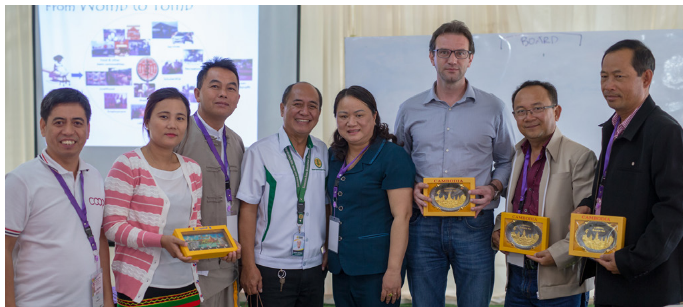
▲ 7th ASEAN Cooperative Business Forum, Manila, 15-18 January 2018