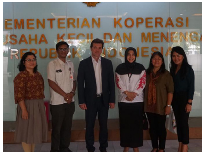
▲ SIS Mission Visit to ACEDAC Secretariat in Jakarta