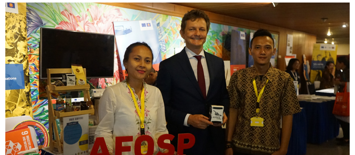
▲ Photo of Farmers and Cooperative Representative with the representative of EU Mission to ASEAN