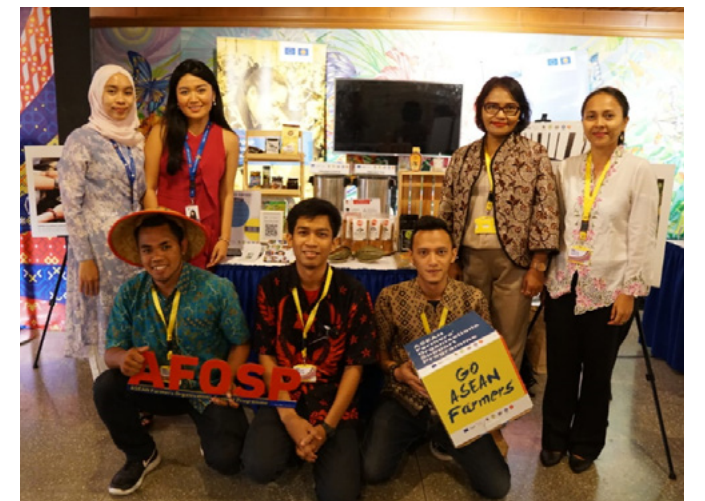
▲ Farmers and Cooperative Representative attend ASEAN-EU Scholarship and Cooperation Day 2019 in ASEAN Secretariat