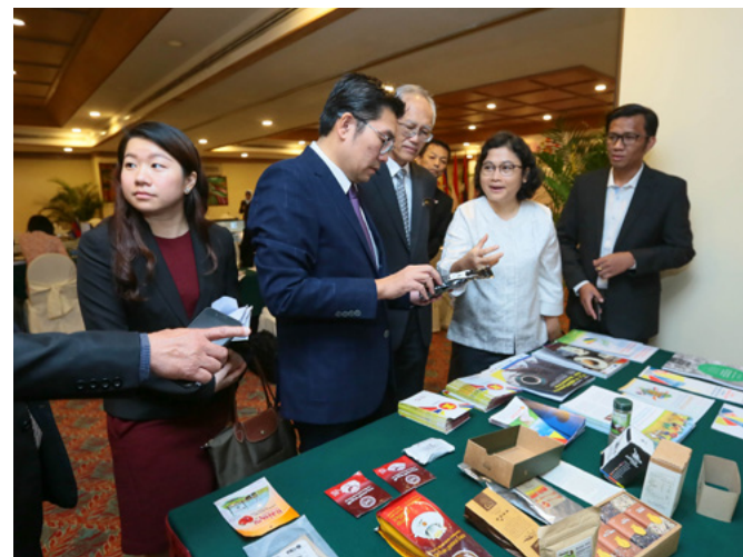
▲ AFOSP attend the 20th ASWGAC and the 25th ACEDAC Meeting, 23-26 July 2018 in Langkawi, Malaysia