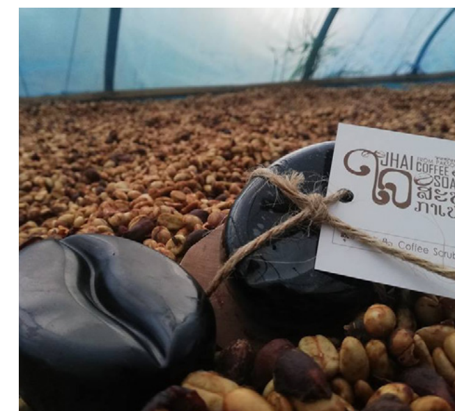
▲ Coffee Soap