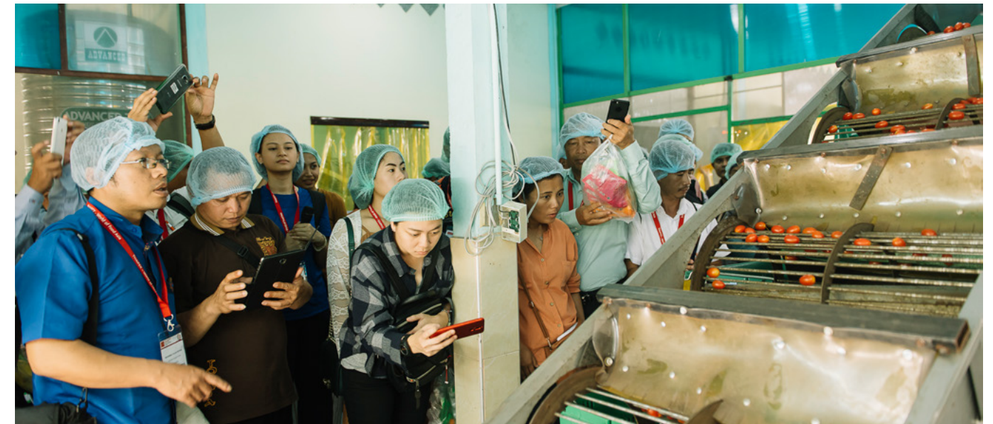
▲ ASEAN Learning Series 2018 (Field Visit to Tomato Farm) in Thailand