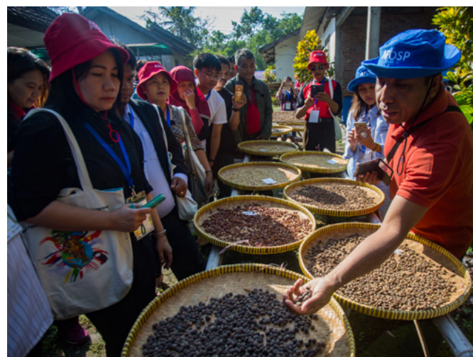
▲ ASEAN Learning Series and Policy Engagement on Agricultural Cooperatives (ALSPEAC), Yogyakarta, 19-21 July 2017