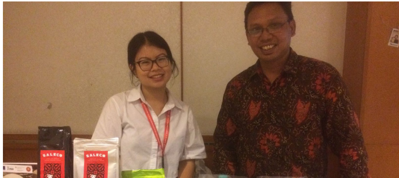
▲ NIA Indonesia and AFOSP Intern attend the ASEAN Youth Expo 2018 in Jakarta