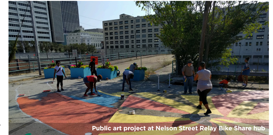
Public art project at Nelson Street Relay Bike Share hub

Riding a bike pushed me out of my comfort zone. Having grown up in rural West Tennessee, I'd never ridden in traffic with cars. I was terrified, to say the least. However, having at least