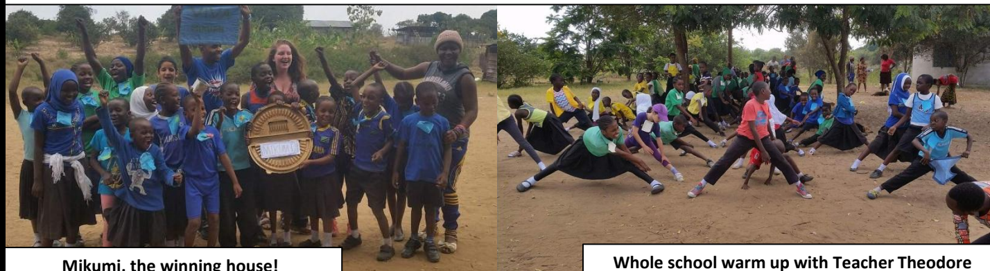
Mikumi, the winning house!