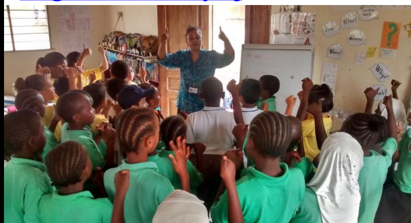
Learning a new song with some students and teachers from DIA.