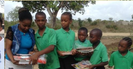
The students sponsored by Trinity