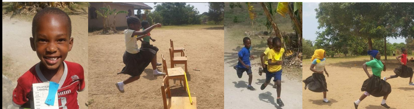
Eric (Prep), U8 girls hurdles, U7 boys distance running, Open girls sprints (heat 1)

Thank you to Volunteers Nic and Will for organising such a superb day!