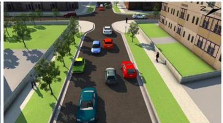
14 Avenue S – Looking West