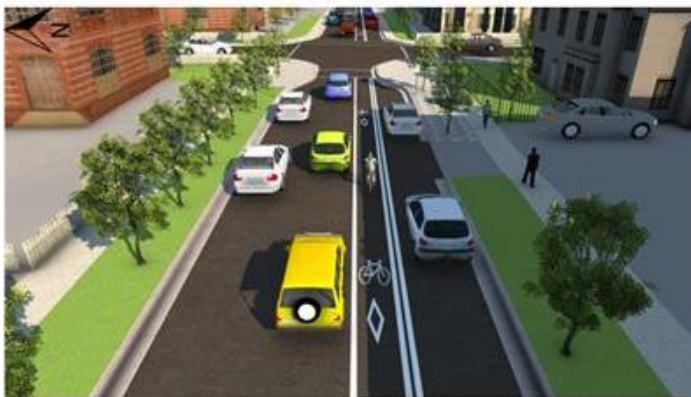
15 Avenue S – Looking East