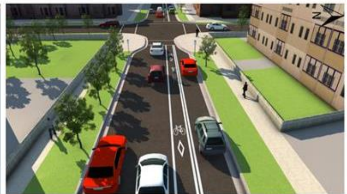
14 Avenue S – Looking West