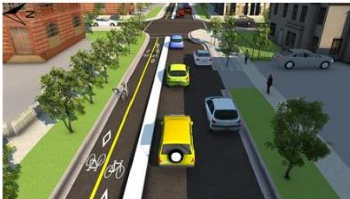
15 Avenue S – Looking East