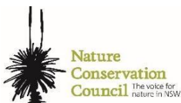
Nature Conservation Council